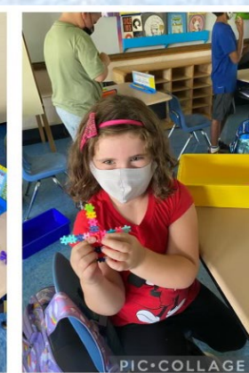
2021-2022 Dance & Gymnastics Program Courses